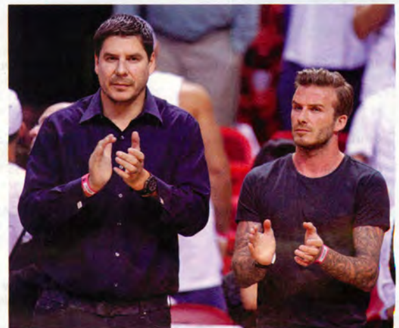
Marcelo Claire (left) and David Beckham

Founder of wireless company Brightstar, the largest U.S. Hispanic-owned business, billionaire Bolivian native Marcelo Claire has seen his profile rise even further since partnering with former soccer star David Beckham and 'American Idol' franchise creator Simon Fuller to bring an MLS team to Miami.